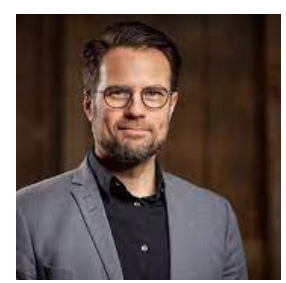
Peter Rahbæk Juel Mayor, City of Odense

I look forward to welcoming you to the City of Odense in 2024.